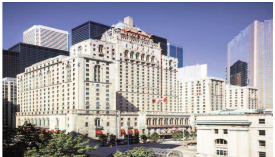
The Fairmont Royal York Hotel

Reservations made after the cut-off dates will be based on availability at the Hotel’s prevailing rates. The conference rates are extended to three days before and after the conference dates based on availability.