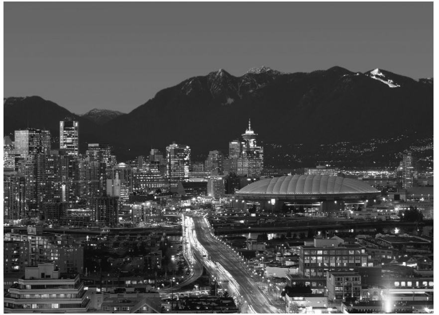
Lookout Harbour Center evening