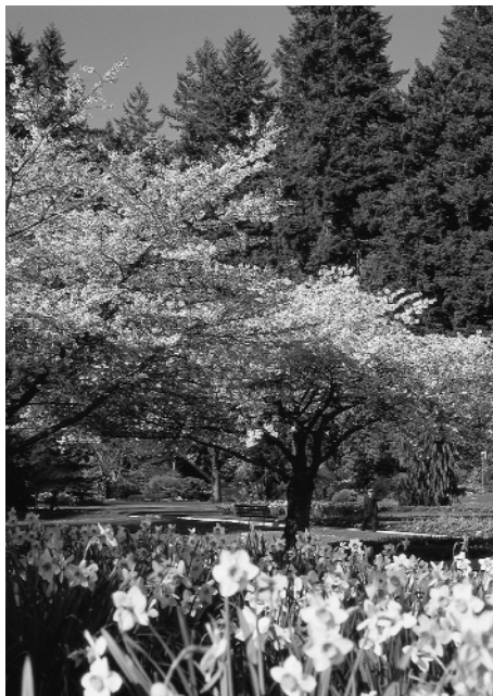
Vancouver's Stanley Park