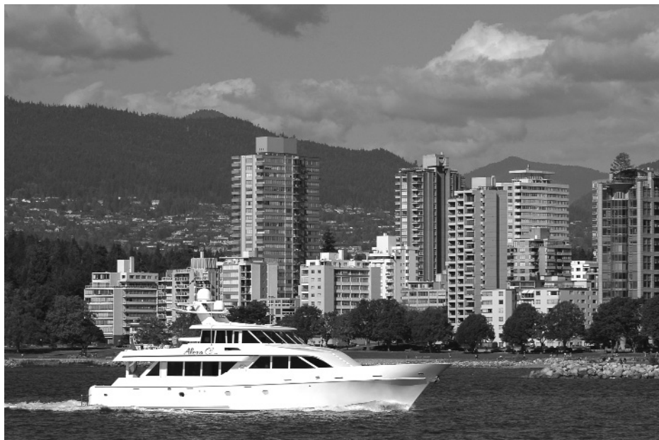
Don't miss the boat! Register for the Annual Conference right away!