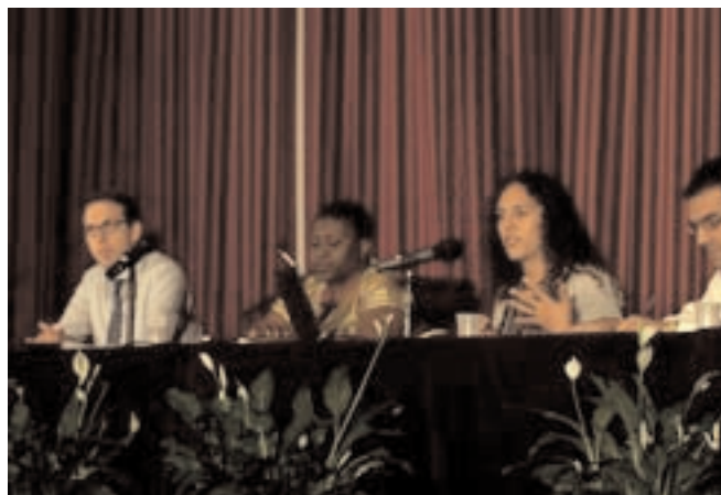
The Young Scholars Panel