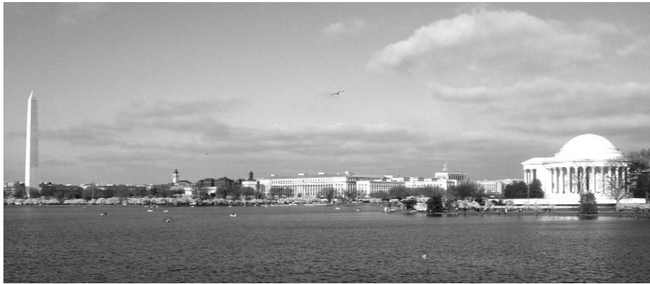
Tidal Basin, Washington, D.C.