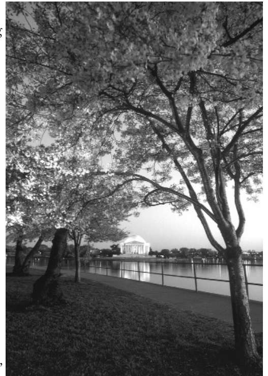
Washington, D.C.